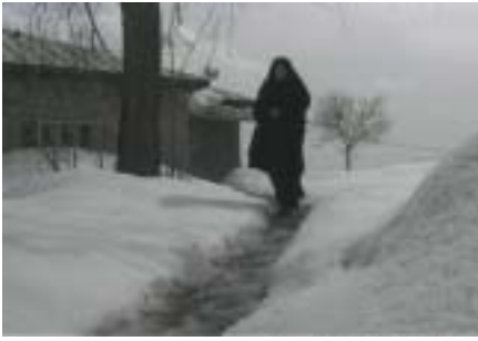
Family planning in Iran