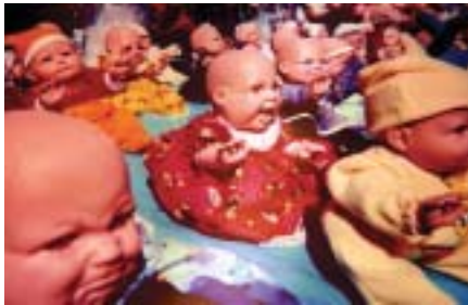
Mexico dolls market